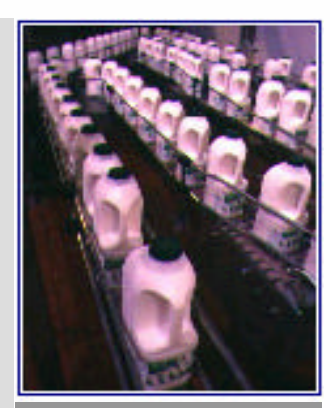
Dairy Crest use 3.1 billion gallons of milk per annum

In many cases, despatch documents have to be produced in special formats for particular customers.