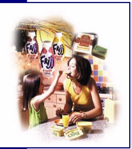
Dairy Crest produces some of the UK's leading dairy produce brands.

Finally Bernard comments "We have used Aries implementation service for most of the work, however, as the tools are so easy to use our own team are able to implement changes to the application if we wish. We also benefit from Aries 24 hour hotline support service".