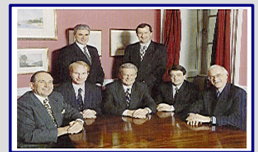
The management team

Customer care is a priority. G.Costa's management team and experienced, friendly staff are on hand to provide customers with the information, products and services required and offer 48 hour delivery nationwide from their purpose built distribution center.