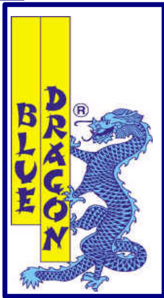
The "Blue Dragon" promise of exciting food