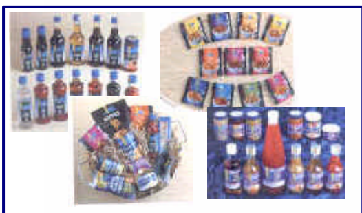
An unequaled range of exotic fare